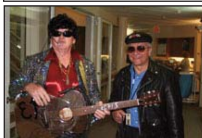
A patient wanted to see Elvis. Through the magic of the Arts Department he and his assistant arrived and put on a performance for a group of patients and their families.